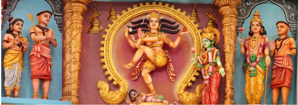
(Sampanthar, Appar, Natarajar, Sivakhami, Sundarar, Manickavasagar at SSVK)

Thiru Navukkarasar (Appar) was a seventh-century Tamil Saiva poet-saint. He is one of the most prominent of the sixty-three revered Nayanmars. He was born in a peasant Saiva family, raised by his sister. He lived to 80 years and is generally placed sometime between 570 and 670 CE. Appar composed 4,900 devotional hymns to the God Shiva, out of which 313 have survived and are now canonized as the 4th to 6th volumes of Tirumurai.